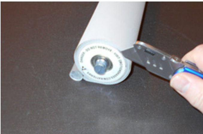
(Step 1) Cut the two safety sticker tabs on the motor end label.

Always wear personal protection equipment, including safety glasses and gloves.