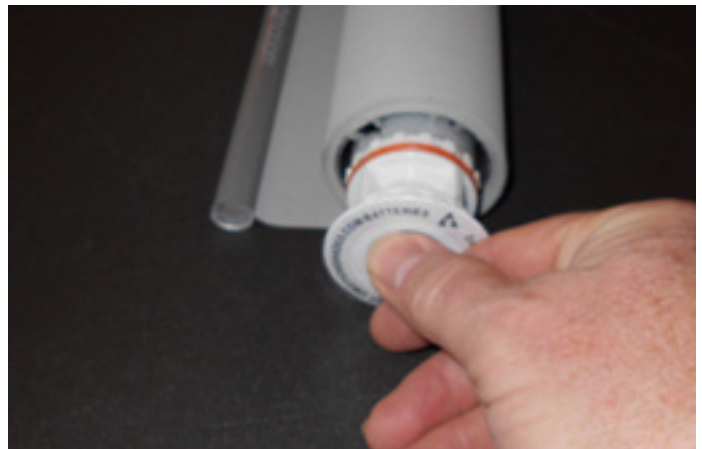
(Step 2a) Pull the Power Spring Counterbalance Assembly out. If the assembly doesn't come out easily, then it may be necessary to push it out.