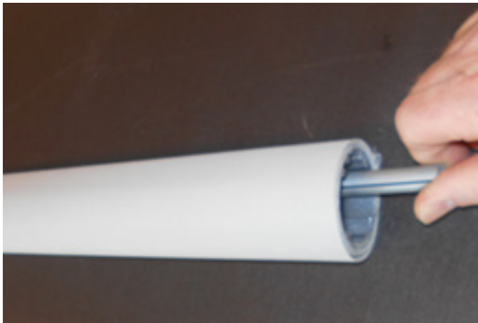
(Step 2b) To push the spring assembly out, remove the motor assembly from the other end. Use a long object (such as the bottom bar) to force the spring out.