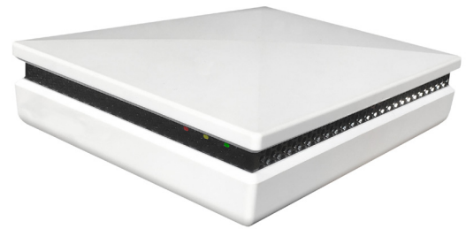
QzHub ZigBee Gateway